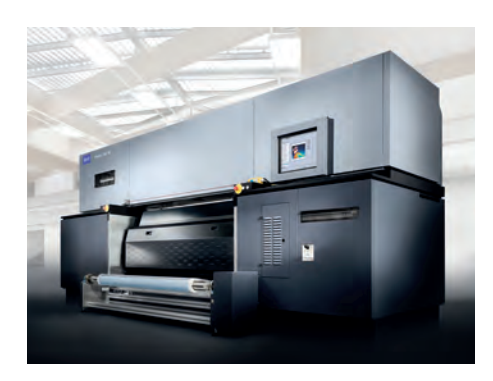
Rhotex 180 TR > Page 8

With the new Rhotex 325, the Rhotex Series has now implemented an efficient high-end production process, to increase cost effectiveness, confirming its role as European market leader, and expanding it global position.