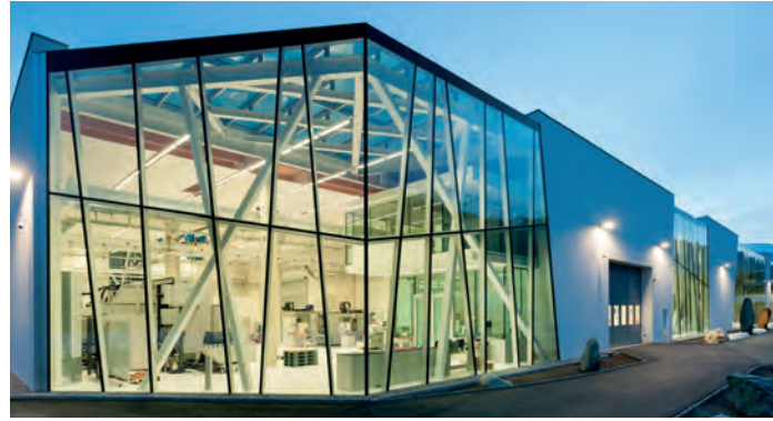
Durst location in Brixen, Italy

Durst is a family-owned company with an 80 year history of values focused on innovation, customer orientation, sustainability and quality.