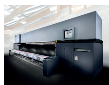
Rhotex 500 > Page 10