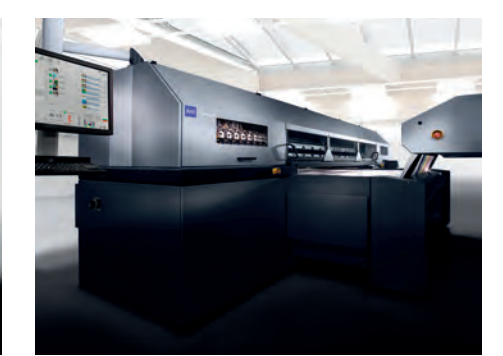
Rhotex HS > Page 11