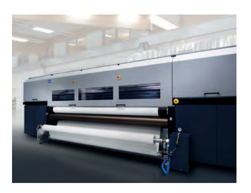
Rhotex 325 > Page 6

Digital large format printing technology offers an extremely wide-range field of application, and revolutionizes production processes in many industrial categories. The broadest application of digital Large Format Printing is in the production of marketing and communication media for trade, POP/POS and Out-Of-Home. Due to its universal value, special applications for museums, interior (wall coverings, furniture, flooring), or industrial printing are also produced by Durst customers globally with this technology. For fifteen-plus years Durst has played a major role in adapting industrial inkjet printing solutions in many segments which include large-format printing, ceramic tile printing, label- and packaging printing and textile printing.