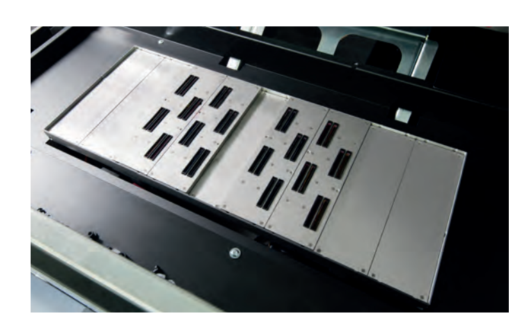
Air-sealed Capping Station

Thanks to an automated purge system, the printhead cleaning operations are minimized, ensuring continuous operation of the printer, with an extremely reduced maintenance time.